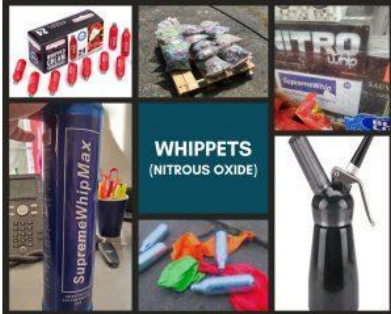
Image: WHIPPETS Collage.png