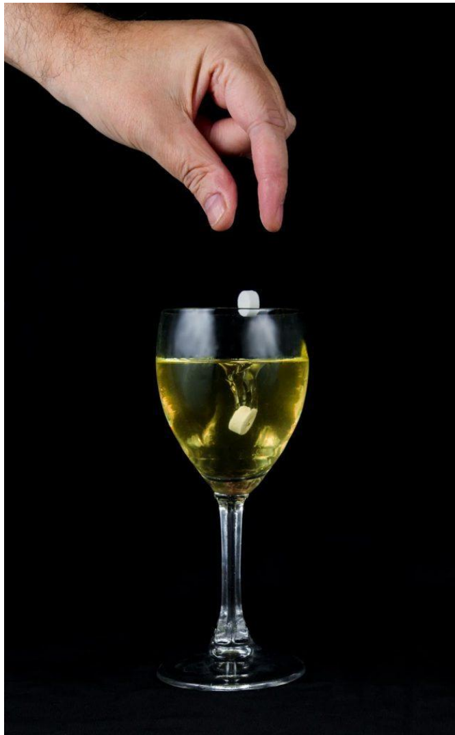
GHB in drink.jpeg

GHB, also known as gamma hydroxybutyrate, is often referred to as the date rape drug . The drug's liquid or white powder may be slipped into a drink