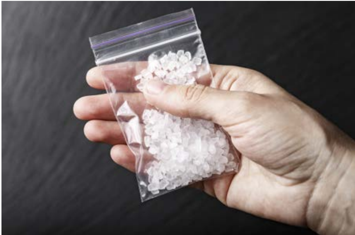
Image: crystal meth.png